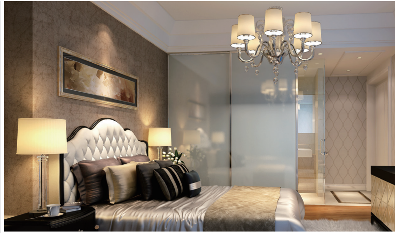
LED EcoMax1 Bulb V7